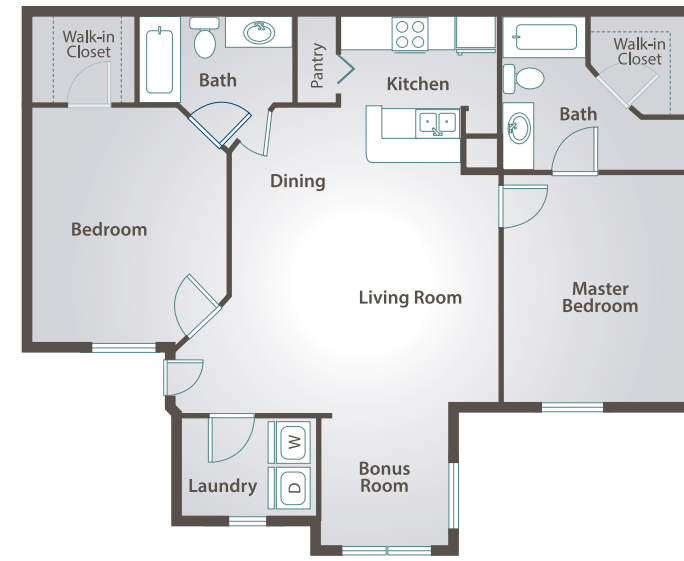
The Palm • 2 Bed 2 Bath • 962 Sq Ft