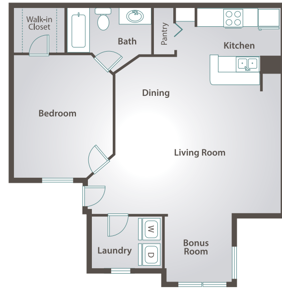
The Cove • 1 Bed 1 Bath • 709 Sq Ft