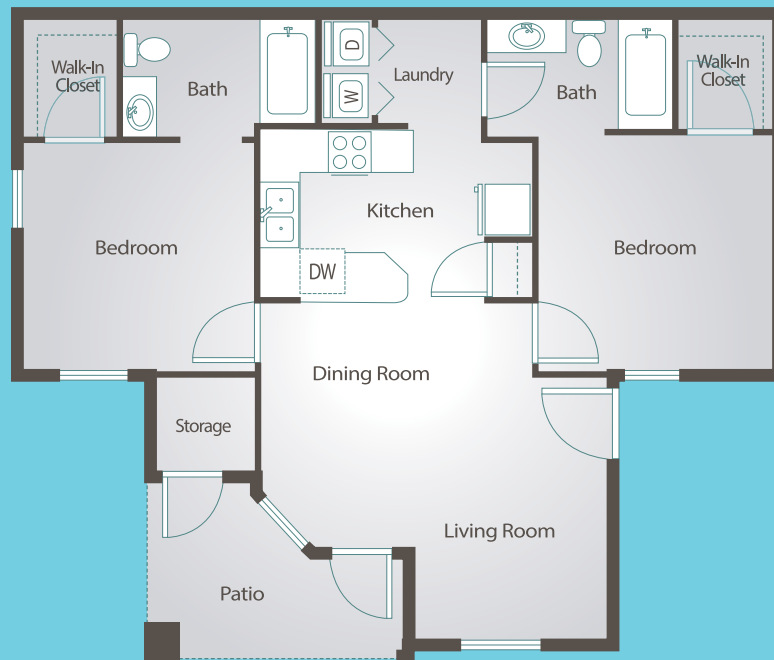
The Oasis • 2 Bed 2 Bath • 1,068 Sq Ft